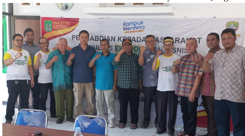
Figure 1 Discussion with Jatigede District Authorities

Based on surveys and discussions at the start of activities carried out with the Development Team and the community in three sub-districts around the Jatigede Reservoir area, including Wado, Darmaraja, And JatigedeIt is known that the potential of the reservoir is: tour nautical, ecotourism, tour culture, And art, agrotourism, tour sport, earth campsite, And track pilgrimage as well as natural landscapes in the form of rice fields. The following is documentation of discussion activities and initial survey results at Jatigede Reservoir.